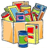
Feeding the Community

We are still accepting donations for Christmas baskets. Please drop food off in the kitchen no later than the weekend of December 9 th & 10 th . Baskets will be packed for distribution the following weekend. We are still in need of the following: